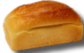
Exhibit to be at the Pavilion by 8.30am on Show Day